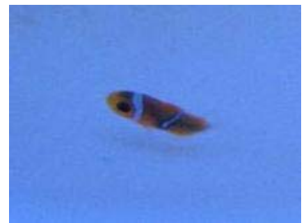
Juvenile anemonefish – day 10