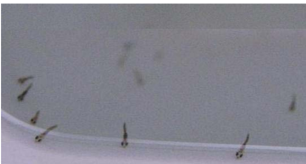
Anemonefish larvae – day 1 (almost transparent)

From the day the eggs hatch until about day 25, everything you do revolves around the two things the larvae and juveniles need to survive: good nutrition and good water quality. I have made a chart that I follow in order to get through these first 3 weeks. I hope that the items I won't be talking about in the chart are pretty self-explanatory.