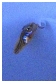
Larvae during metamorphosis. By morning, it will have changed to a juvenile